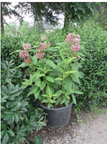
Common Milkweed plant

Why don't you give container gardening with native plants a try? I've only tried Common Milkweed so far, but I'm sure there are other hardy natives that would adjust to living their lives in a container. Keep in mind that caterpillars often will travel quite a distance from their host plants to pupate, so have your containers close to shrubs and other plants. Also, don't cut off the old stalks until well into the spring so birds can feed on the seedheads over the winter and insects can overwinter in the stalks.