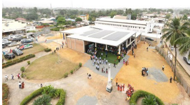
Liberian Learning Center

The Liberian Learning Center is a complex of three facilities in Paynesville, Liberia. It is focused on transforming education in the region and providing access to learning resources for over 250,000 community members. The Center will be built in three phases. Phase One will include a Public Library, a Children's Library, and a Small Business Incubation Center. It is planning on opening its doors on December 6, 2024.