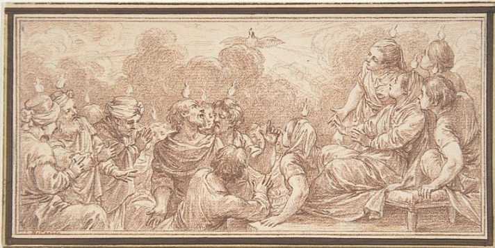
The Coming of the Holy Spirit at Pentecost-Charles-Nicolas Cochin

The spirit apparently chose to postpone my official retirement as pastor of Trinity to the beginning of May. Pentecost has always meant to surrender to the sometimes-unexpected flow of life with God and facing the unpredictable as we follow Christ.