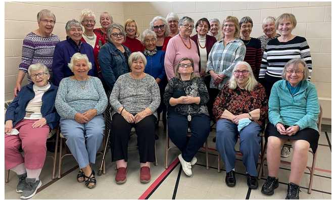
Members of the Lutheran Ladies United

We have a great group of members, and we would like to invite more friends to come and share in our uplifting activities. Come and sing with us. Come and learn more about our community through interesting guest speakers. Come and join our faith journey through devotions and shared fellowship.