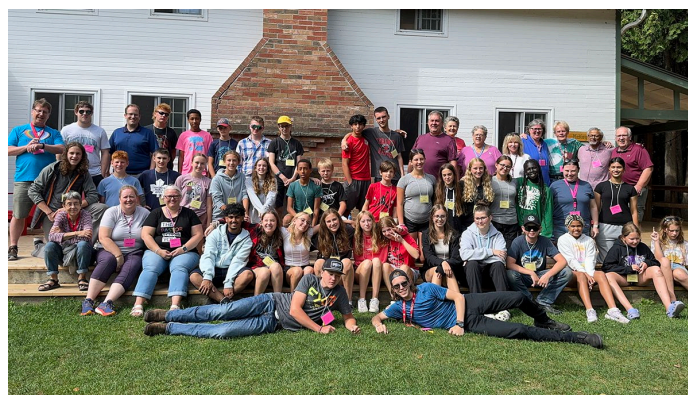
Confirmation students enjoyed a week at Camp Kintail with other young Lutherans.