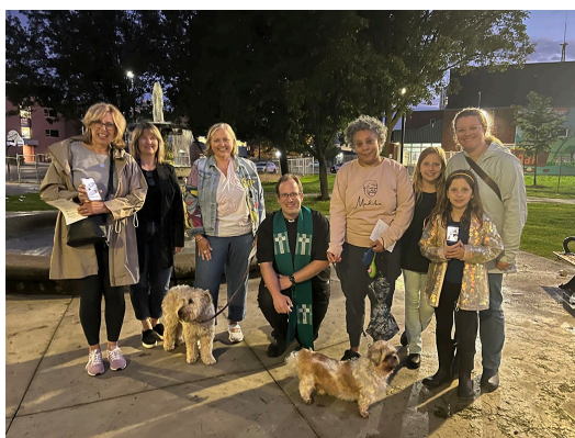
On St. Francis' Day several members, pets, and visitors met at Beasley Park for the blessing of the animals.